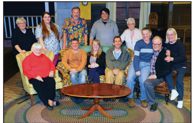
Over the River and Through the Woods