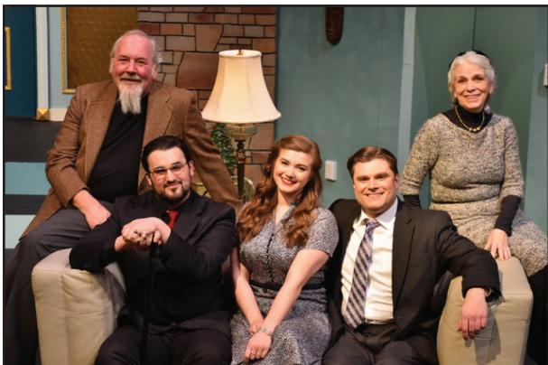
Bell, Book and Candle