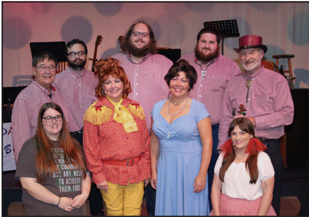
Always ... Patsy Cline

Thank you for your support of Driftwood Theatre.