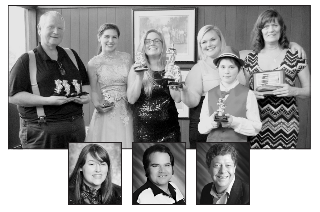
Group photo