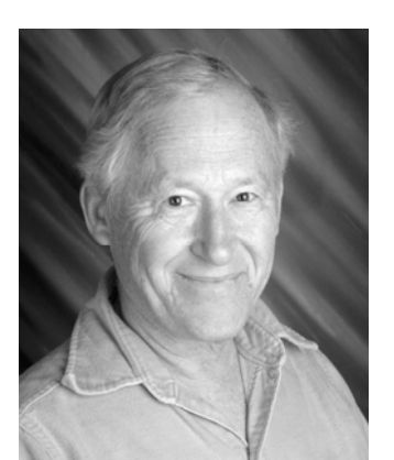
Actor: Dave Foscue