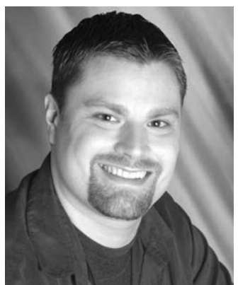
Actor: Brain Blackburn